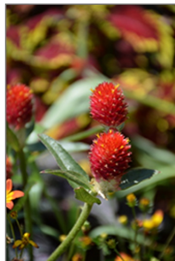
Forest Red Globe Amaranth flowers

Forest Red Globe Amaranth is recommended for the following landscape applications;