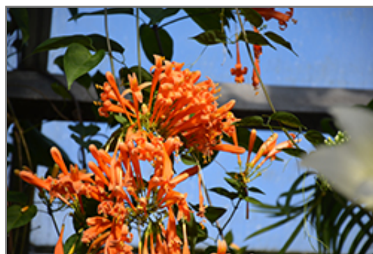
Flame Vine flowers