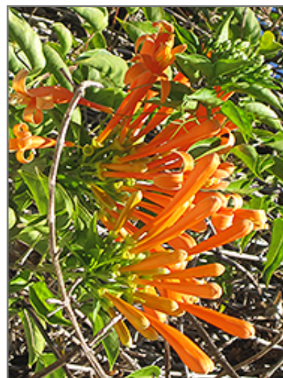
Flame Vine flowers

This is a dense multi-stemmed evergreen houseplant with a spreading, ground-hugging habit of growth. Its relatively fine texture sets it apart from other indoor plants with less refined foliage. This plant may benefit from an occasional pruning to look its best.