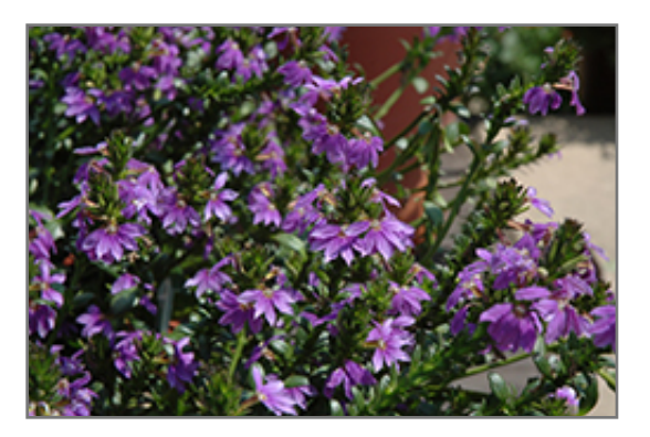
Scalora Top Pot Blue Fan Flower flowers

Scalora Top Pot Blue Fan Flower will grow to be about 10 inches tall at maturity, with a spread of 24 inches. When grown in masses or used as a bedding plant, individual plants should be spaced approximately 18 inches apart. Its foliage tends to remain low and dense right to the ground. Although it's not a true annual, this fast-growing plant can be expected to behave as an annual in our climate if left outdoors over the winter, usually needing replacement the following year. As such, gardeners should take into consideration that it will perform differently than it would in its native habitat.