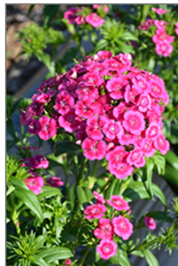
Jolt Pink Hybrid Pinks flowers