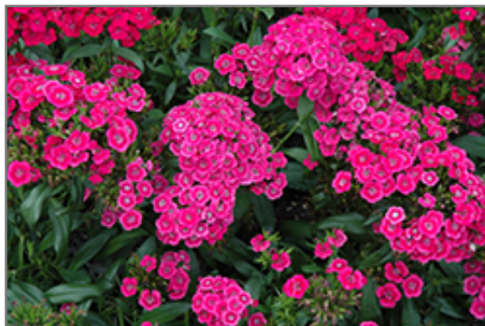
Jolt Pink Hybrid Pinks flowers

This is a relatively low maintenance plant, and is best cleaned up in early spring before it resumes active growth for the season. It is a good choice for attracting bees and butterflies to your yard, but is not particularly attractive to deer who tend to leave it alone in favor of tastier treats. It has no significant negative characteristics.