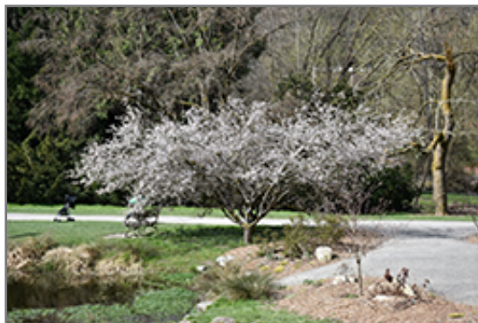
Fuji Cherry in bloom