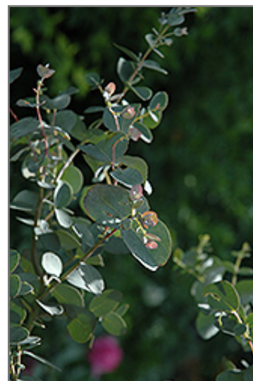
Silver Drop Cider Gum foliage