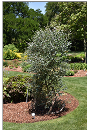
Silver Drop Cider Gum

Silver Drop Cider Gum makes a fine choice for the outdoor landscape, but it is also well-suited for use in outdoor pots and containers. With its upright habit of growth, it is best suited for use as a 'thriller' in the 'spiller-thriller-filler' container combination; plant it near the center of the pot, surrounded by smaller plants and those that spill over the edges. It is even sizeable enough that it can be grown alone in a suitable container. Note that when grown in a container, it may not perform exactly as indicated on the tag - this is to be expected. Also note that when growing plants in outdoor containers and baskets, they may require more frequent waterings than they would in the yard or garden.