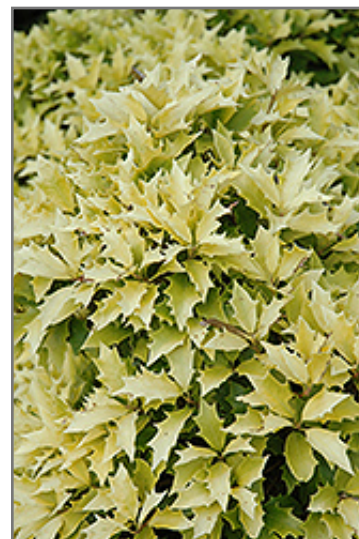
Goldenleaf False Holly foliage