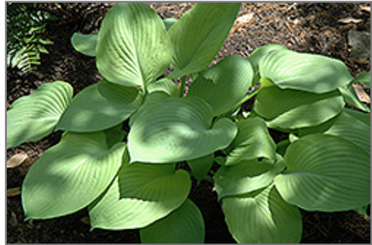
Diva Hosta