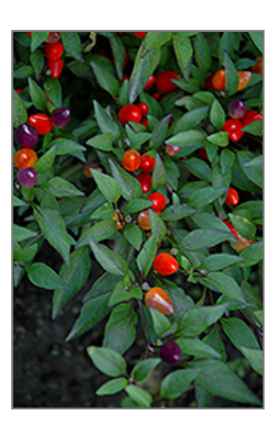
NuMex Centennial Ornamental Pepper fruit

NuMex Centennial Ornamental Pepper is an herbaceous annual with an upright spreading habit of growth. Its medium texture blends into the garden, but can always be balanced by a couple of finer or coarser plants for an effective composition.