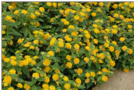
Little Lucky Pot Of Gold Lantana flowers

Little Lucky Pot Of Gold Lantana is recommended for the following landscape applications;