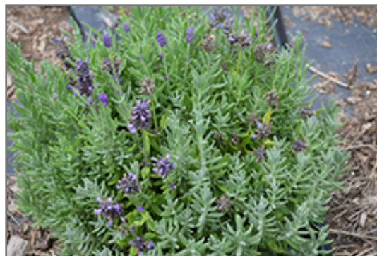
Mini Blue Lavender in bloom