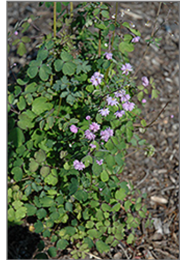
Hewitt's Double Meadow Rue in bloom