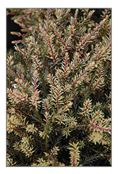
County Park Fire Alpine Plum Yew foliage