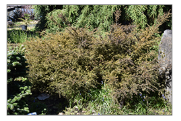
County Park Fire Alpine Plum Yew