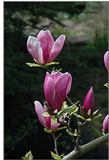
Lilac Chalice Magnolia flowers

Lilac Chalice Magnolia will grow to be about 12 feet tall at maturity, with a spread of 10 feet. It has a low canopy with a typical clearance of 2 feet from the ground, and is suitable for planting under power lines. It grows at a medium rate, and under ideal conditions can be expected to live for 50 years or more.