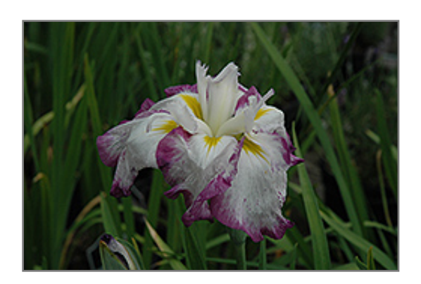
Freckled Geisha Japanese Flag Iris flowers