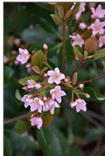
Pink Lady Indian Hawthorn flowers

Pink Lady Indian Hawthorn is recommended for the following landscape applications;