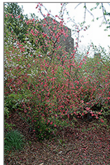
Pink Lady Flowering Quince in bloom