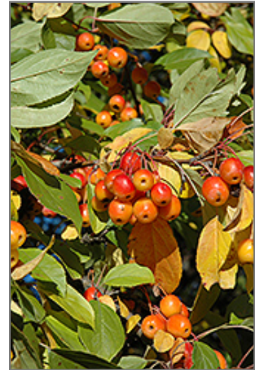
Professor Sprenger Flowering Crab fruit

This tree should only be grown in full sunlight. It prefers to grow in average to moist conditions, and shouldn't be allowed to dry out. It is not particular as to soil type or pH. It is highly tolerant of urban pollution and will even thrive in inner city environments. This particular variety is an interspecific hybrid.