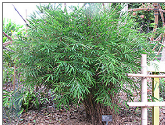
Blue Stemmed Bamboo