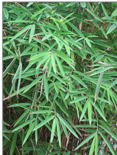
Blue Stemmed Bamboo foliage

This plant does best in partial shade to shade. It requires an evenly moist well-drained soil for optimal growth. It is not particular as to soil type or pH. It is somewhat tolerant of urban pollution, and will benefit from being planted in a relatively sheltered location. This species is not originally from North America. It can be propagated by division.