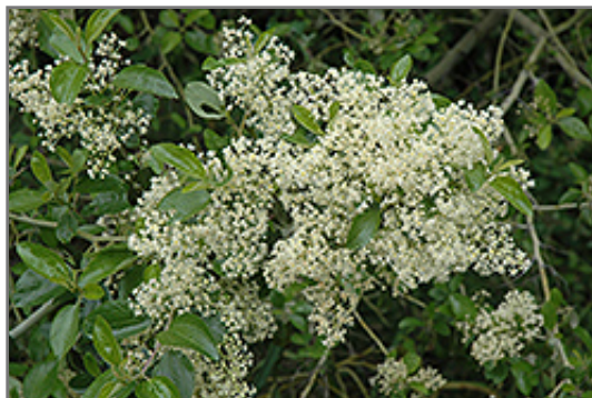
Coast Whitethorn flowers

Coast Whitethorn is recommended for the following landscape applications;