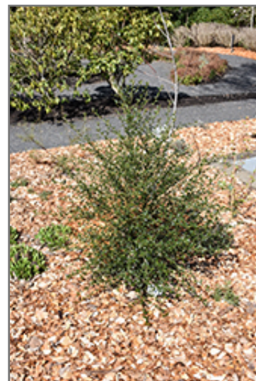
Kurt Zadnik California Lilac