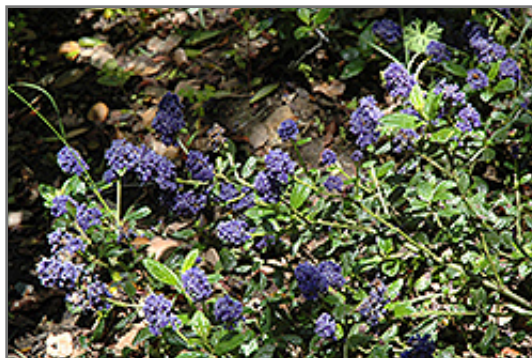
Kurt Zadnik California Lilac in bloom

This is a relatively low maintenance shrub, and should only be pruned after flowering to avoid removing any of the current season's flowers. It is a good choice for attracting bees and butterflies to your yard, but is not particularly attractive to deer who tend to leave it alone in favor of tastier treats. Gardeners should be aware of the following characteristic(s) that may warrant special consideration;