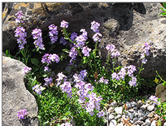
Alpine Liverbalm in bloom