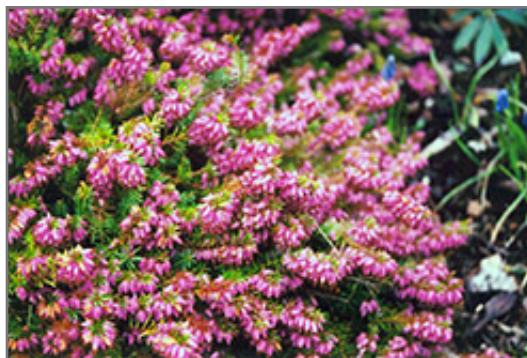
Gold Haze Heather flowers