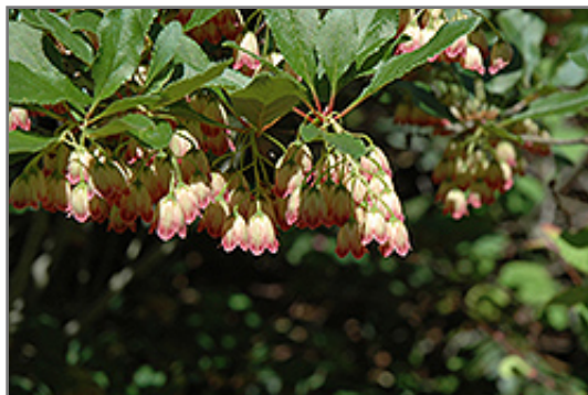
Hollandia Red Enkianthus flowers

Hollandia Red Enkianthus is recommended for the following landscape applications;