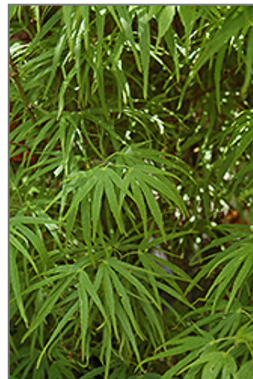
Scolopendrifolium Japanese Maple foliage

Scolopendrifolium Japanese Maple is recommended for the following landscape applications;