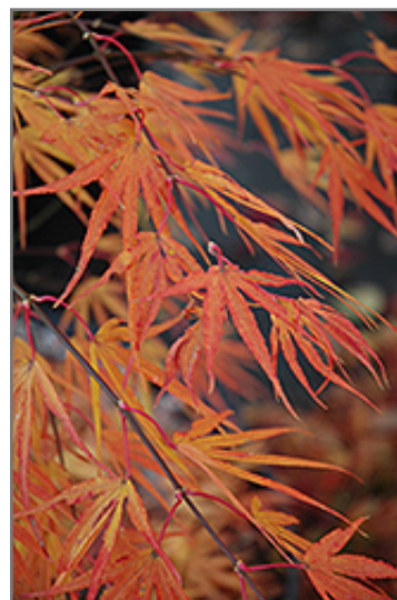
Scolopendrifolium Japanese Maple in fall

Scolopendrifolium Japanese Maple is a fine choice for the yard, but it is also a good selection for planting in outdoor pots and containers. Its large size and upright habit of growth lend it for use as a solitary accent, or in a composition surrounded by smaller plants around the base and those that spill over the edges. It is even sizeable enough that it can be grown alone in a suitable container. Note that when grown in a container, it may not perform exactly as indicated on the tag - this is to be expected. Also note that when growing plants in outdoor containers and baskets, they may require more frequent waterings than they would in the yard or garden.