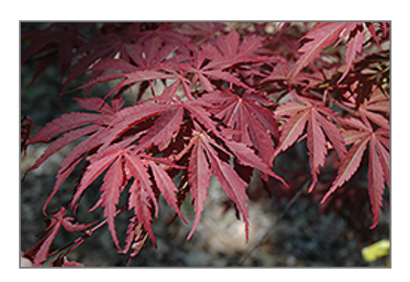
Oshu Shidare Japanese Maple foliage