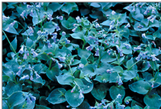
Siberian Bluebells flowers