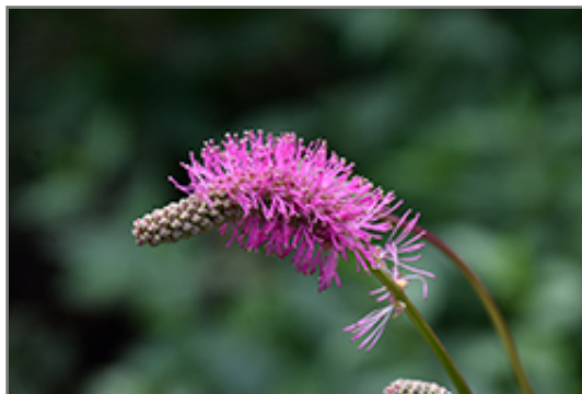
Japanese Bottlebrush flowers

Japanese Bottlebrush is recommended for the following landscape applications;