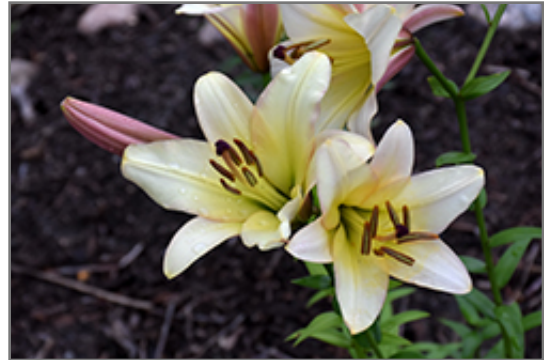
Silky Belles Lily flowers

Silky Belles Lily is recommended for the following landscape applications;