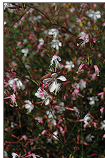
Snowstorm Gaura flowers

Snowstorm Gaura is recommended for the following landscape applications;