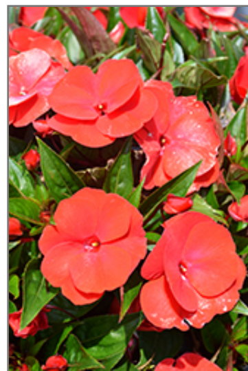
Petticoat True Red Magnum New Guinea Impatiens flowers

Petticoat True Red Magnum New Guinea Impatiens is recommended for the following landscape applications;