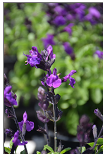
Mirage Violet Autumn Sage flowers

This is a relatively low maintenance plant, and should only be pruned after flowering to avoid removing any of the current season's flowers. It is a good choice for attracting bees, butterflies and hummingbirds to your yard, but is not particularly attractive to deer who tend to leave it alone in favor of tastier treats. It has no significant negative characteristics.