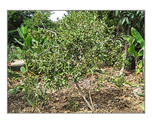
Common Guava

This shrub is quite ornamental as well as edible, and is as much at home in a landscape or flower garden as it is in a designated edibles garden. It does best in full sun to partial shade. You may want to keep it away from hot, dry locations that receive direct afternoon sun or which get reflected sunlight, such as against the south side of a white wall. It prefers to grow in average to moist conditions, and shouldn't be allowed to dry out. This plant should not require much in the way of fertilizing once established palthough it may appreciate a shot of general-purpose fertilizer from time to time early in the growing season by a standard about its soil conditions, with a strong preference for rich, acidic soils. It is quite intolerant of urban pollution, therefore inner city or urban streetside plantings are best avoided. Consider applying a thick much around the root zone over the growing season to conserve soil moisture. This species is not