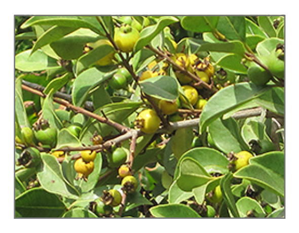
Common Guava fruit