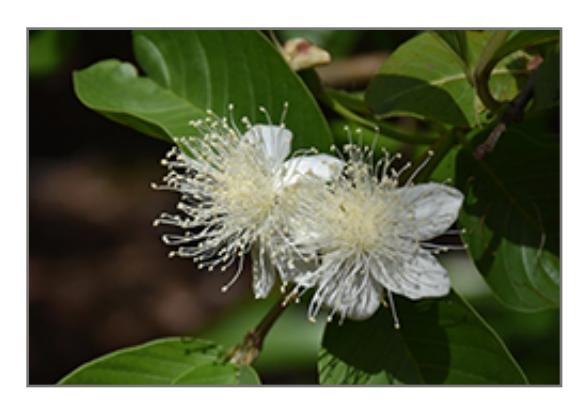
Common Guava flowers