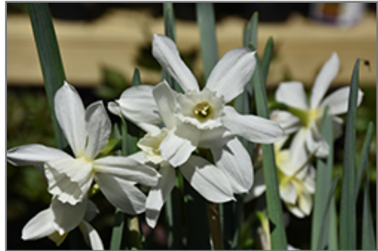
Thalia Daffodil flowers

Thalia Daffodil is recommended for the following landscape applications;