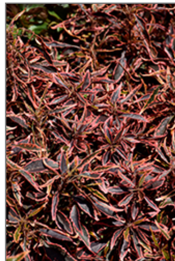
Firestorm Copperleaf foliage

This is a multi-stemmed evergreen houseplant with an upright spreading habit of growth. Its relatively fine texture sets it apart from other indoor plants with less refined foliage. This plant may benefit from an occasional pruning to look its best.