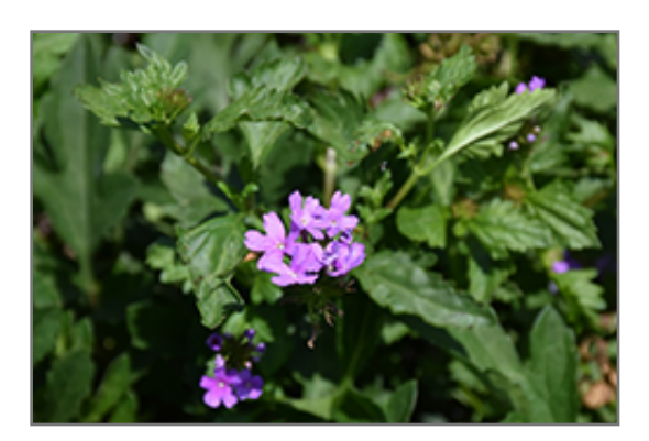
Beach Verbena flowers