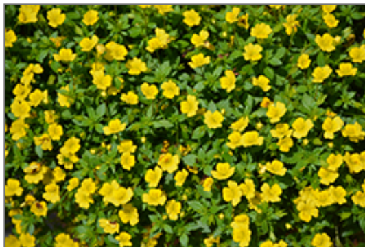
Garden Freckles Mecardonia flowers