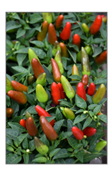
Acapulco Red Ornamental Pepper fruit

Acapulco Red Ornamental Pepper is an herbaceous annual with an upright spreading habit of growth. Its medium texture blends into the garden, but can always be balanced by a couple of finer or coarser plants for an effective composition.