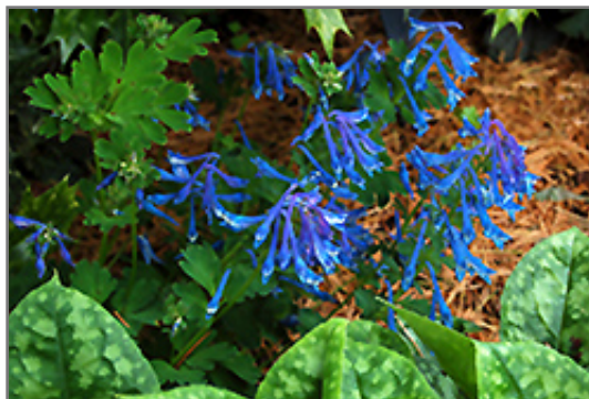
Blue Corydalis flowers