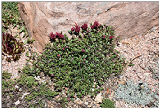
Marian Sampson Scarlet Monardella in bloom

Marian Sampson Scarlet Monardella will grow to be only 3 inches tall at maturity extending to 5 inches tall with the flowers, with a spread of 12 inches. When grown in masses or used as a bedding plant, individual plants should be spaced approximately 8 inches apart. Its foliage tends to remain low and dense right to the ground. It grows at a medium rate, and under ideal conditions can be expected to live for approximately 3 years. As an evergreen perennial, this plant will typically keep its form and foliage year-round.