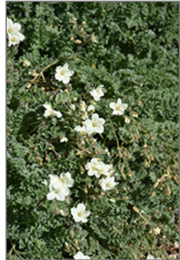
Yellow Heron's Bill flowers

Yellow Heron's Bill is recommended for the following landscape applications;