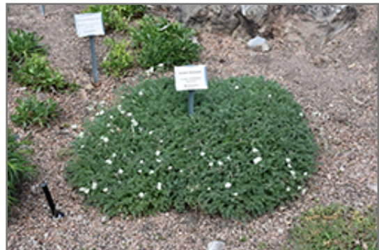
Yellow Heron's Bill in bloom