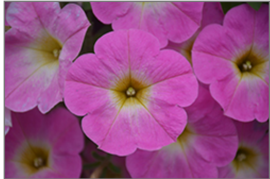
Sweetunia Pink Lemonade Petunia flowers

This plant will require occasional maintenance and upkeep. Trim off the flower heads after they fade and die to encourage more blooms late into the season. It is a good choice for attracting butterflies and hummingbirds to your yard, but is not particularly attractive to deer who tend to leave it alone in favor of tastier treats. It has no significant negative characteristics.