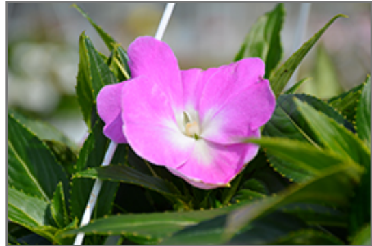
Painted Select Light Lavender New Guinea Impatiens flowers

Painted Select Light Lavender New Guinea Impatiens is recommended for the following landscape applications;