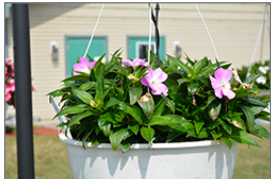
Painted Select Light Lavender New Guinea Impatiens in bloom