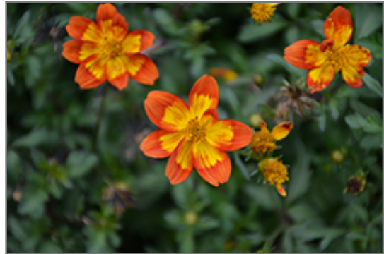
Bidy Boom Wildfire Bidens flowers

Bidy Boom Wildfire Bidens is recommended for the following landscape applications;