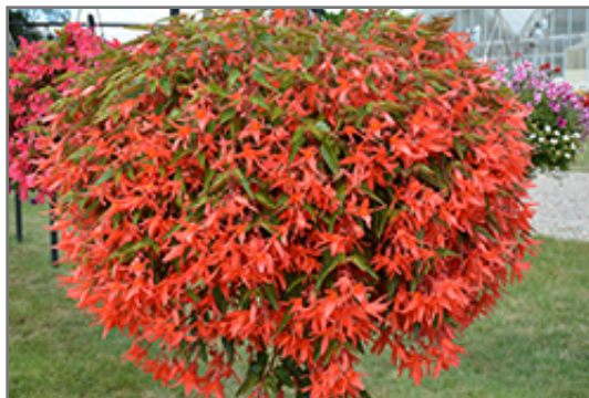
Beauvillia Dark Salmon Begonia in bloom