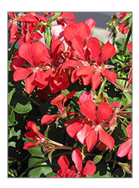
Blizzard Red Ivy Leaf Geranium flowers