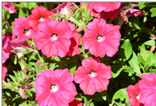
Opera Supreme Coral Petunia flowers

Opera Supreme Coral Petunia is recommended for the following landscape applications;