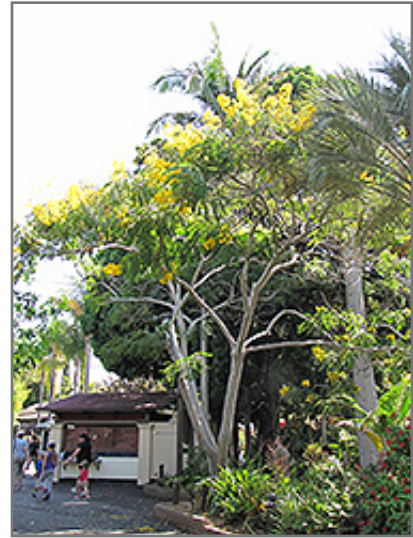
Whitebark Senna in bloom

This tree should only be grown in full sunlight. It is very adaptable to both dry and moist locations, and should do just fine under average home landscape conditions. It is not particular as to soil type or pH. It is somewhat tolerant of urban pollution. This species is not originally from North America, and parts of it are known to be toxic to humans and animals, so care should be exercised in planting it around children and pets.