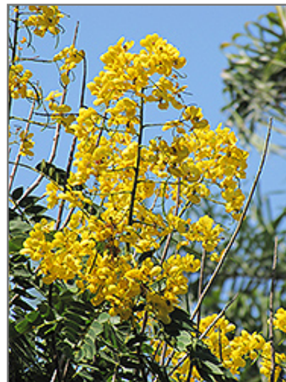
Whitebark Senna flowers

This tree will require occasional maintenance and upkeep, and should only be pruned after flowering to avoid removing any of the current season's flowers. It is a good choice for attracting birds and bees to your yard. Gardeners should be aware of the following characteristic(s) that may warrant special consideration;