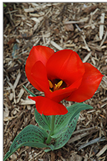
Casa Grande Tulip flowers