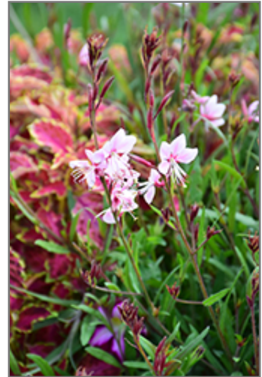
Grace Compact Pink Gaura flowers

Grace Compact Pink Gaura is recommended for the following landscape applications;